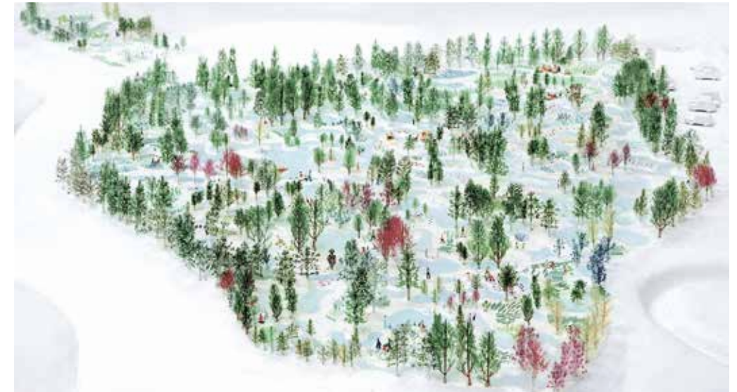
An image sketch of the Water Garden in 2014