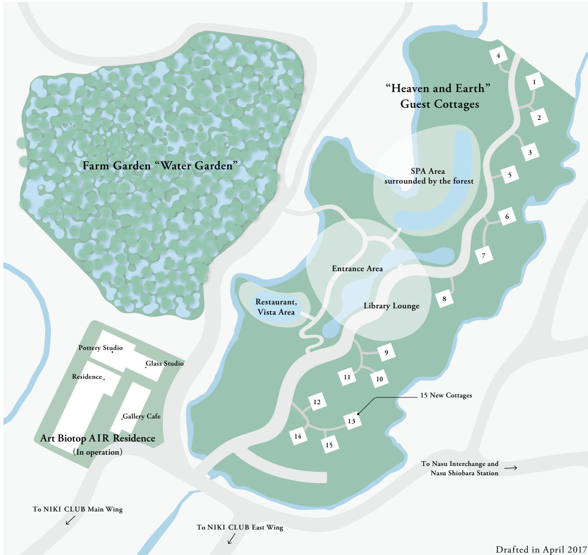
Drafted in April 2017

The Botanical Farm Garden Art Biotop We began with the creation of the Water Garden in 2017, and will continue with the unique cottages connecting heaven and earth, the restaurant, and Spa facilities to be completed in 2019.